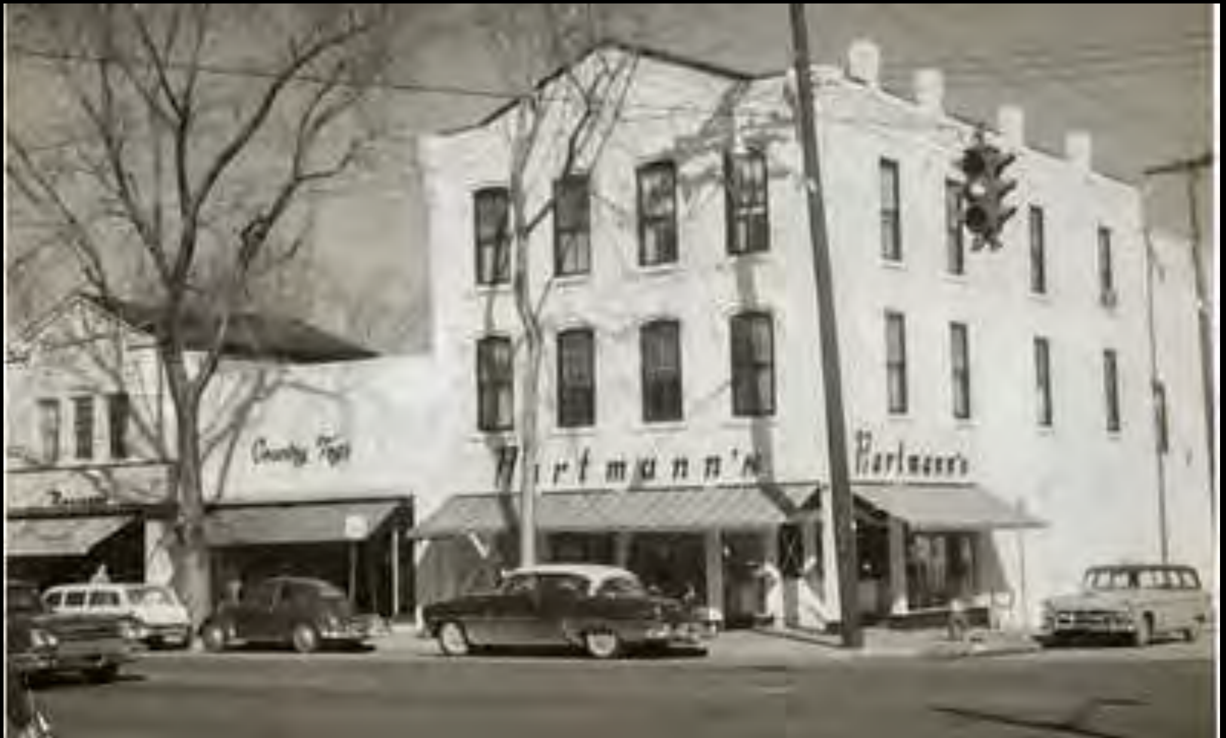
Photo of Huntington, NY in 1960's