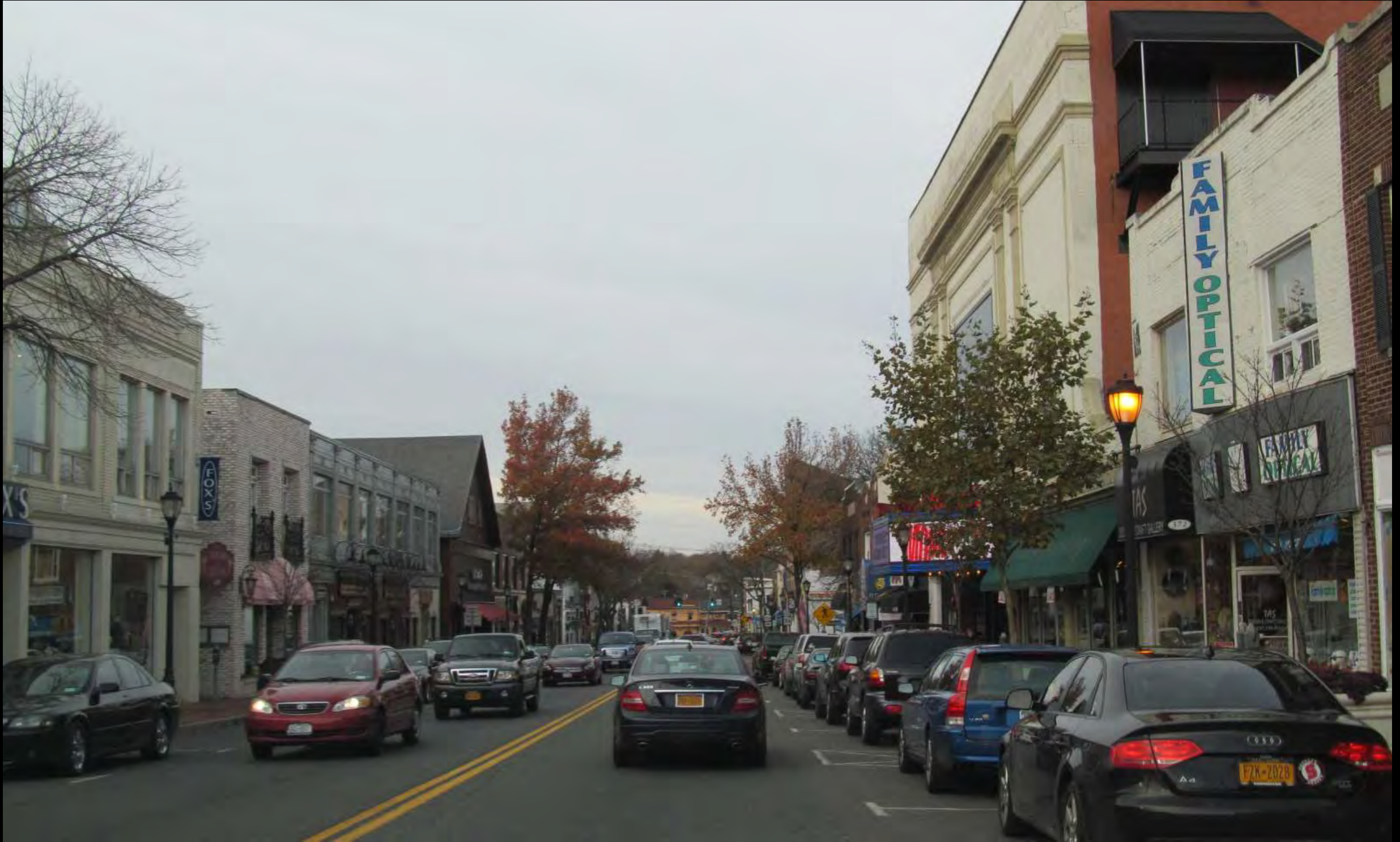
Current Photo of Huntington, NY