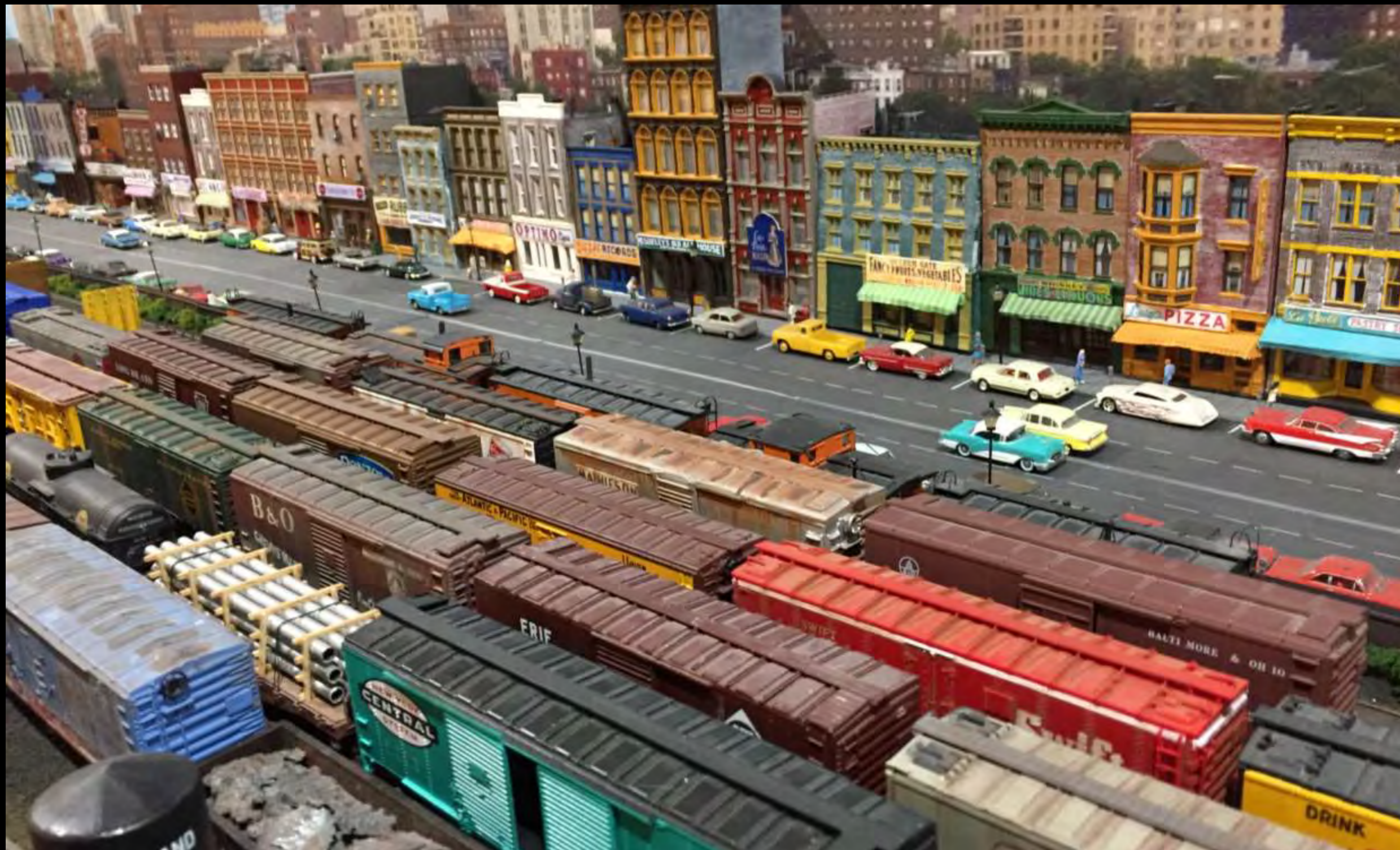
Another View of Holban Yard on my LIRR Layout