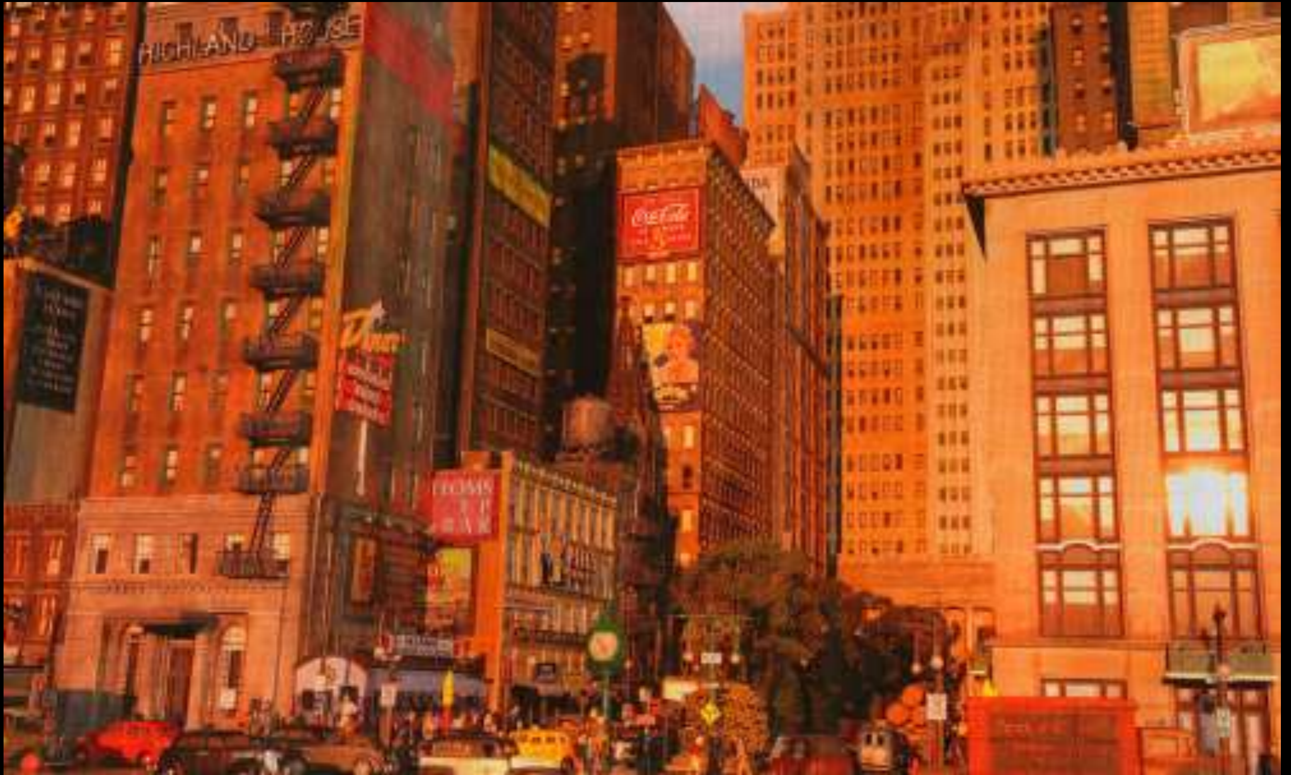
High-Rise Buildings Behind Lower Foreground Buildings Rod Stewart's Layout