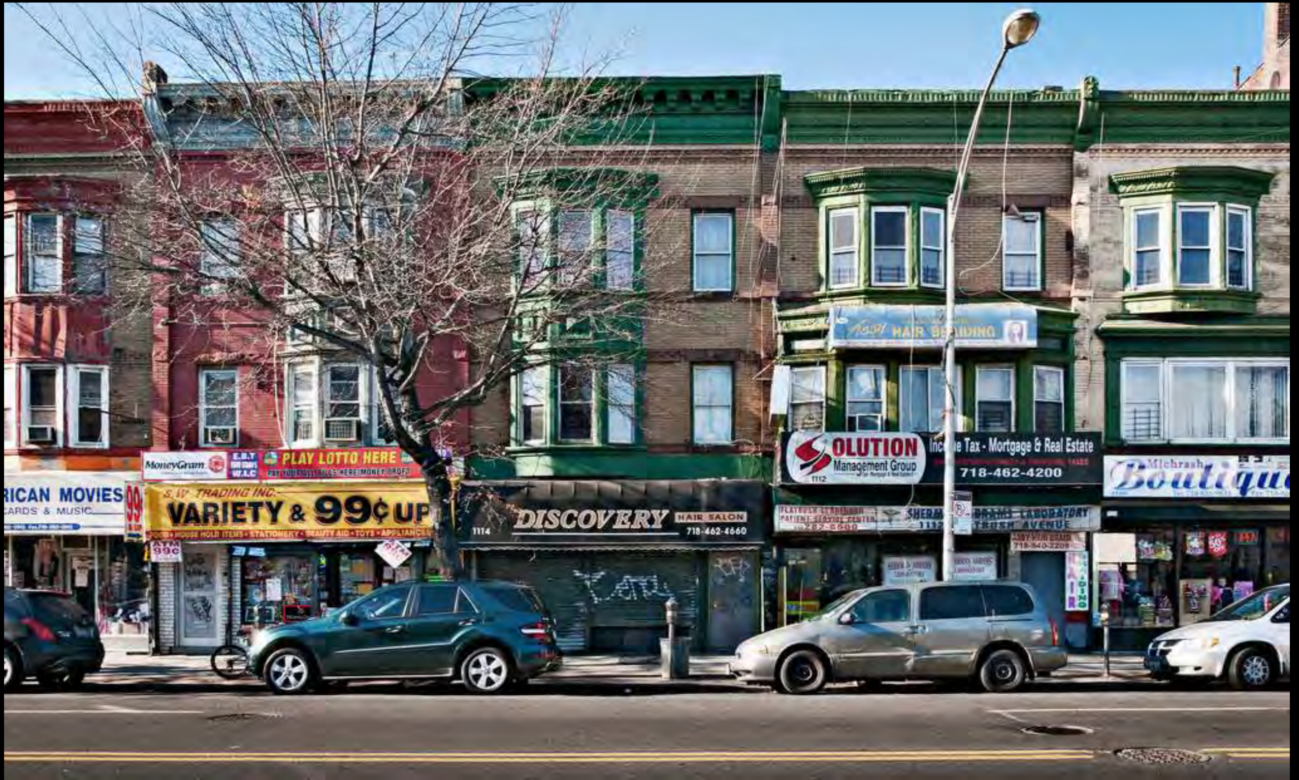
Another street in Brooklyn