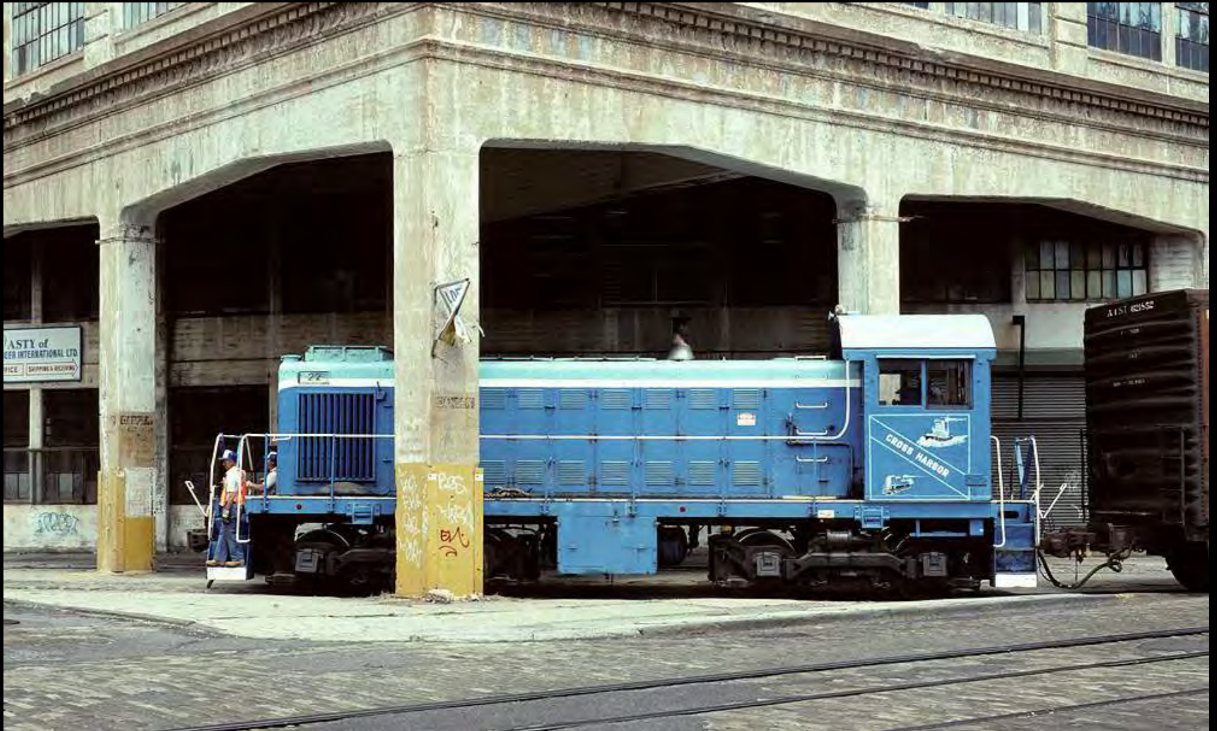
Cross harbor RR in NYC