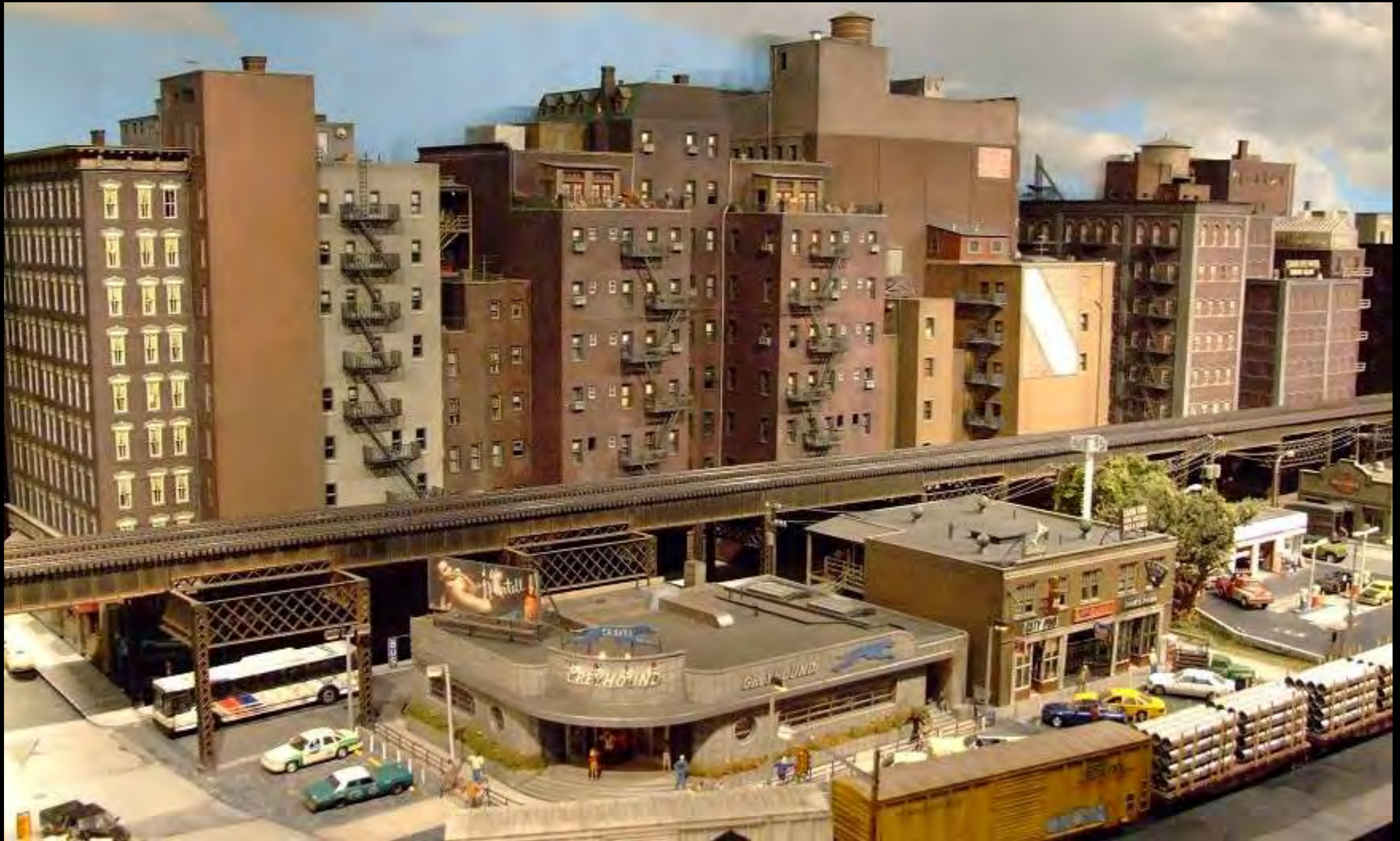
Another View of Vic Smith's City Edge Railroad