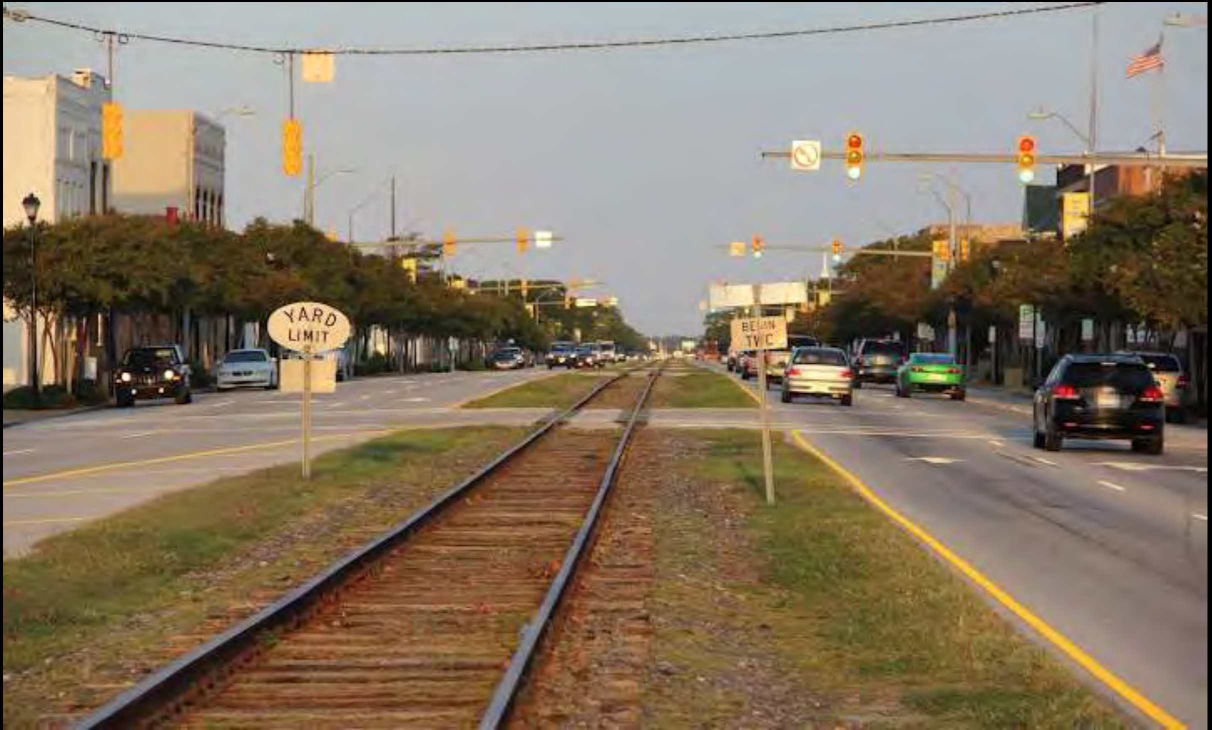
Railroad Tracks Run Through Center of Main Street in Moorehead City, N.C.