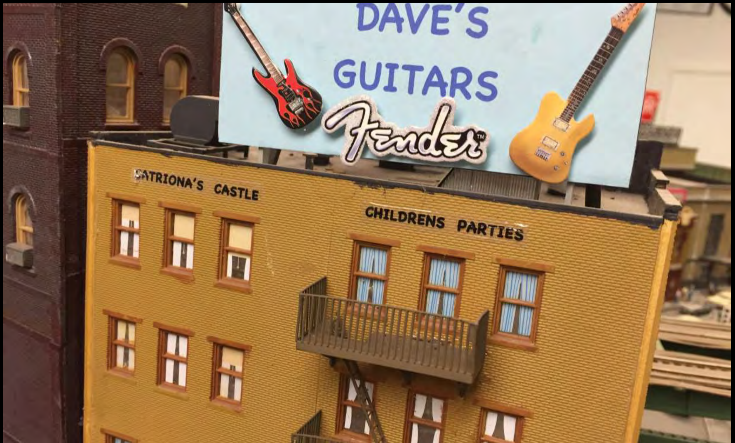
Guitar and “Fender” Icons Mounted on a Rooftop Sign