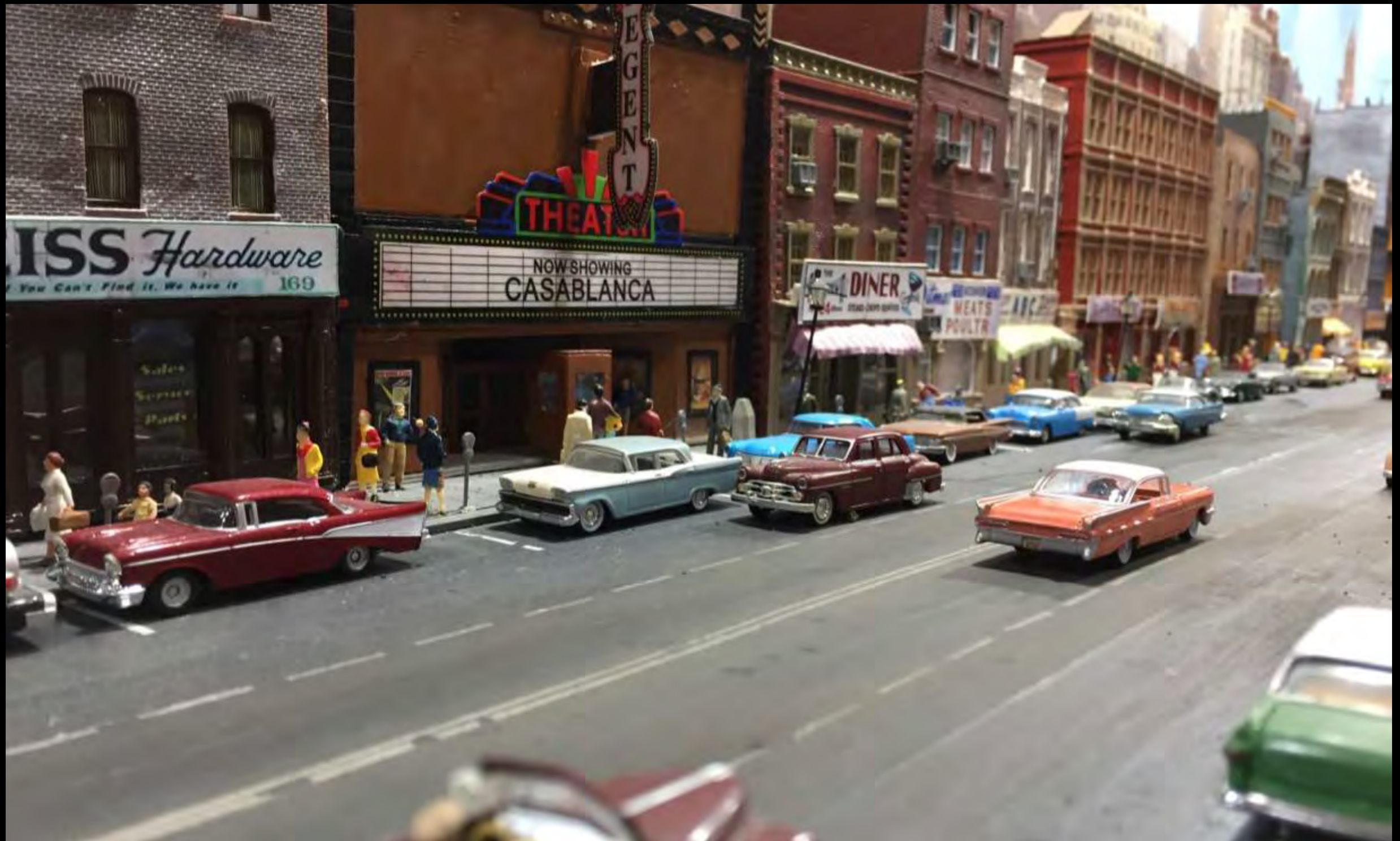
Miller Engineering Theater Marquee Adapted to Walthers Palace Theater