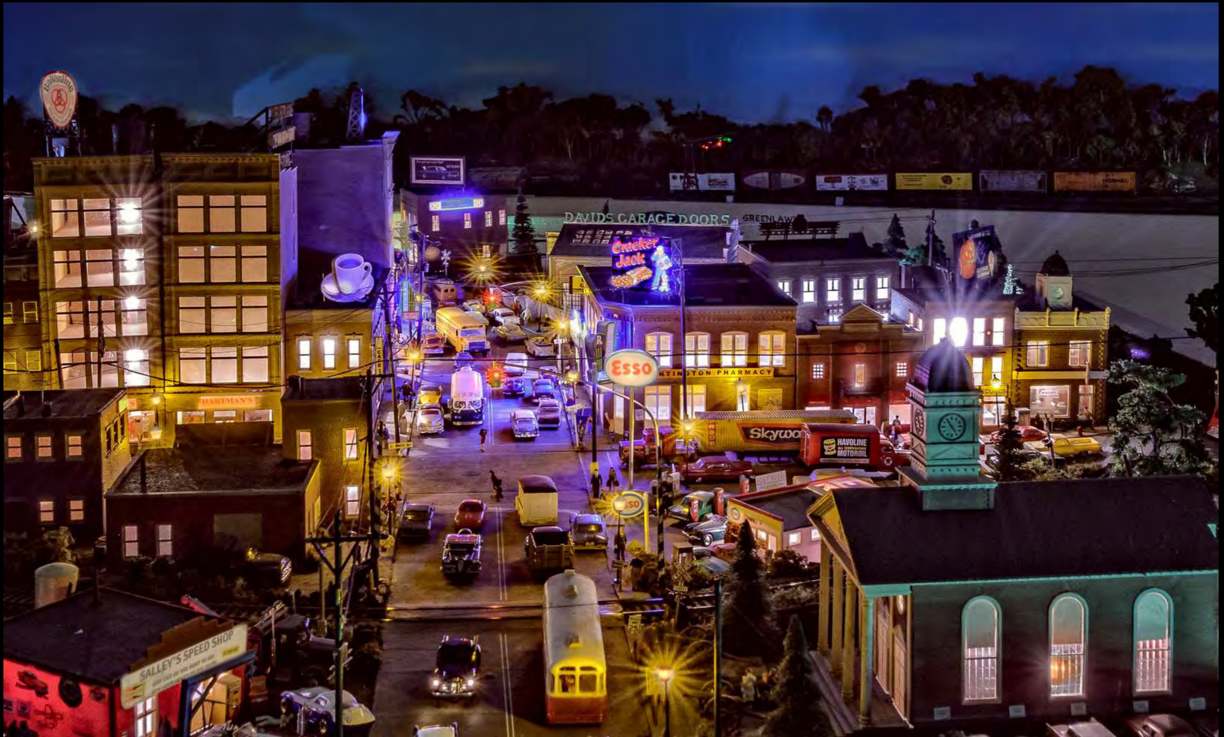
Night time View of Huntington