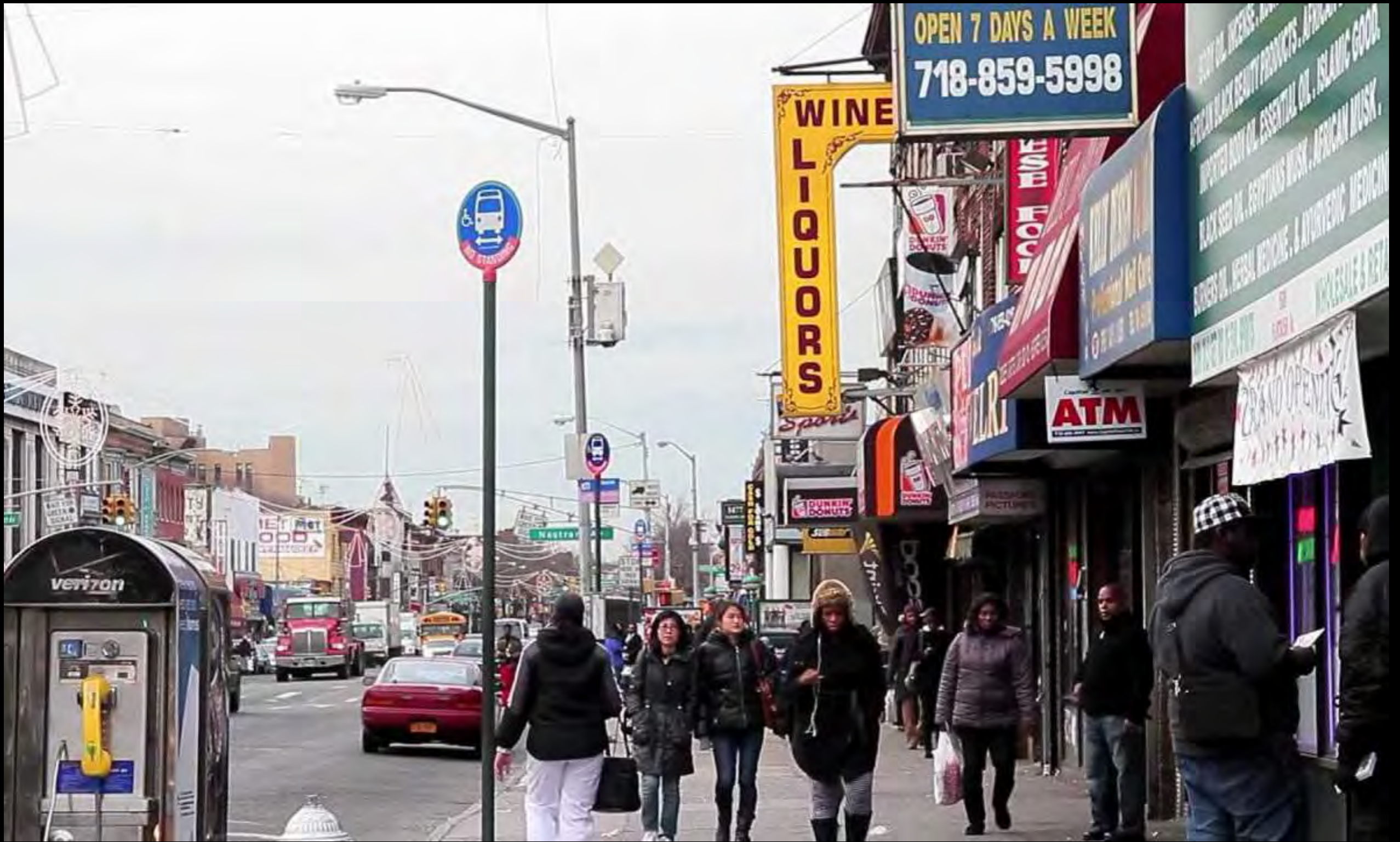
A street in Brooklyn